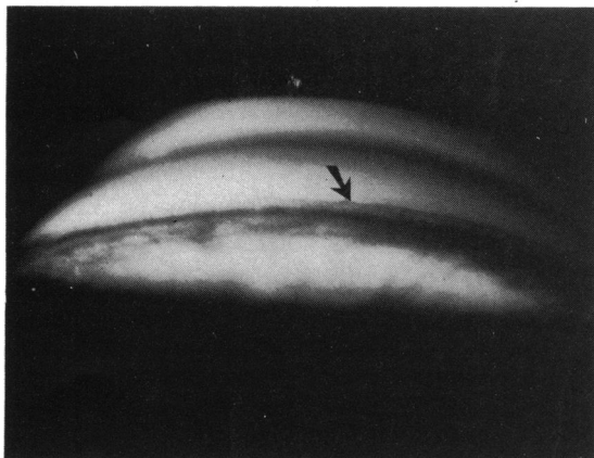
Fig. 2 Narrow anterior chamber angles are more common in patients with the exfoliation syndrome than in age matched controls. This appears not to be merely a factor of the use of miotics but an aspect of the disease itself.

We believe the high incidence of closed angles in our population may reflect the increased visualisation of PAS made possible by indentation gonioscopy 8 performed routinely on all our patients. The much higher incidence of narrow and closed angles in our patients with ES compared with our primary glaucoma control group makes it unlikely that we are describing a drug-induced effect. It should be noted that treatment with ecothiopate has been thought to be related causally to the occurrence of angle closure glaucoma in patients with ES. 15 In our series of cases